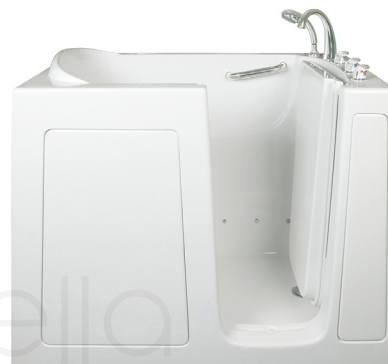
305214R Right Hand Door and Drain

Actual Size: 30" W x 51.5" L x 41" H Shipping Size: 31" W x 52" L x 42" H Shipping Weight: 280 lbs. Net Weight: 225 lbs. Water Capacity: 90 gal. US (unoccupied) 55-75 gal. US (occupied)