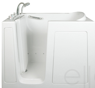
305214L Left Hand Door and Drain